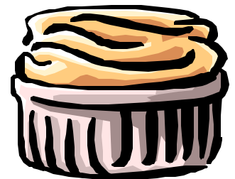
Bread Pudding with Currents and Raisins rates as ultimate comfort food.